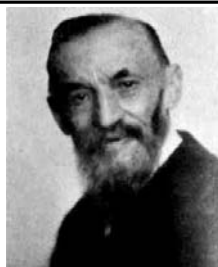
Giuseppe Peano † (1858-1932)

1.1. a). (First principle of induction) Using the third axiom of Peano prove the following : Suppose that for each natural number n \in \mathbb{N} , we have associated a statement S(n) . Assume that the following conditions are satisfied :